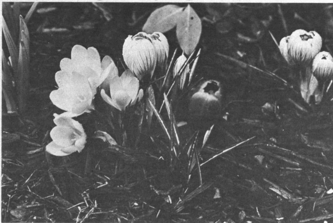
The crocuses are in bloom brightening the facade of the Dorrance and Whitaker Buildings.