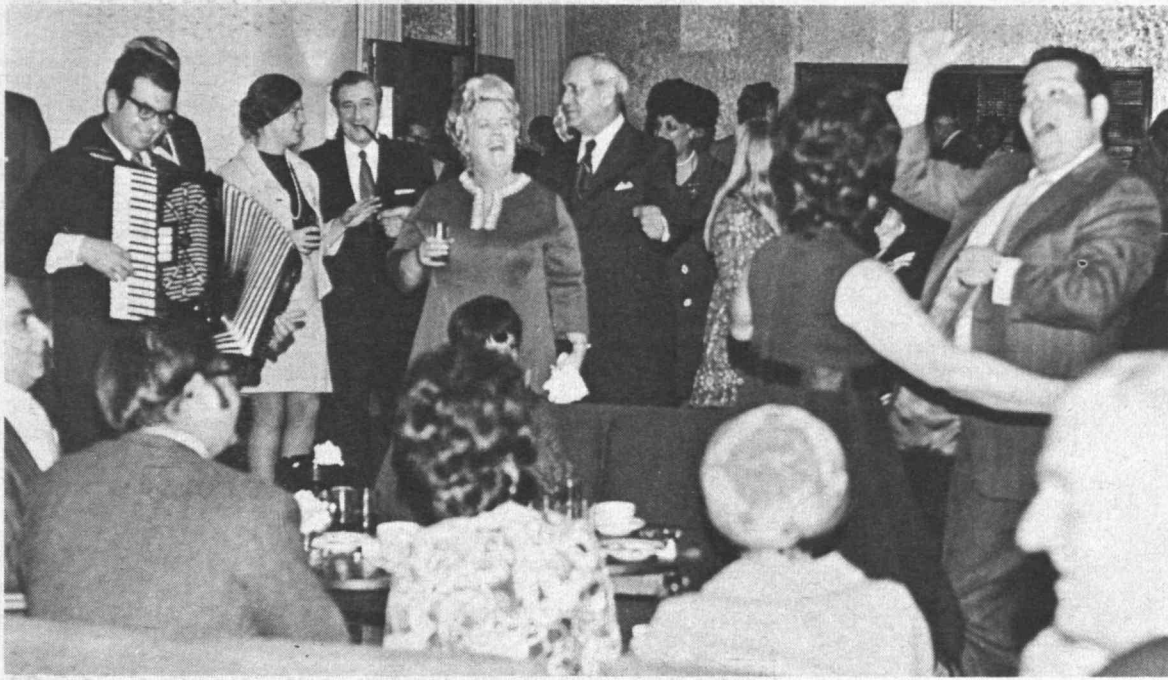
Guests at the ceremonial groundbreaking broke into impromptu singing and ethnic dancing in celebrating the start of construction.