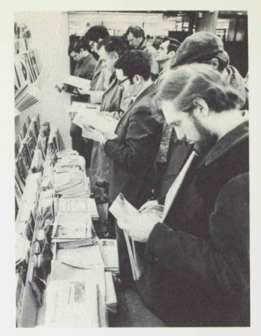
Magazine browsers and long lines at the cashier will be less of a problem after the Coop Lobby Shop is renovated.

During the Spring vacation (March 29–April 3) workmen will rip up the store's ceiling and install a $7,000 air conditioner. When the shop reopens April 4, a new soft drink case will hold enough sodas to let them all stay cold. The Lobby