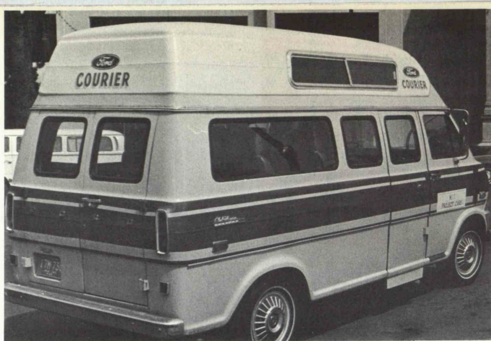
CARS' minibus features comfortable seats and plenty of headroom.