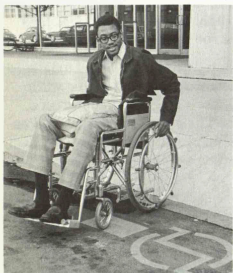
Arnold frequently uses the ramp in front of the Bush Building--when it's available.

This year when you're asked to pledge, keep the United Fund motto in mind--Think twice, you give only once!