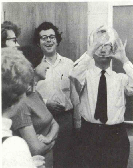
Dr. Luria and his friends celebrating.

MASSACHUSETTS INSTITUTE OF TECHNOLOGY October 29, 1969