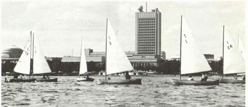
The Charles is a popular place on fine fall days.

Less spectacular thievery is more common, of course, and much of it goes unreported, but the Patrol follows through on every complaint it gets. Preventive action is also part of the Patrol's responsibility. Many secretaries were appreciative recently when patrolmen visited every office in the main complex to warn that a purse snatcher was roaming through the halls.