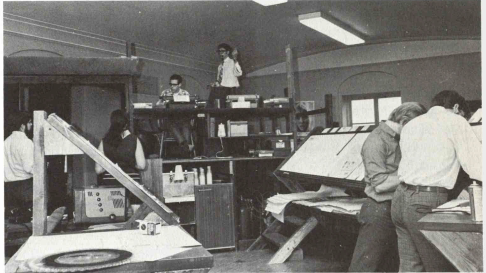
As press time approaches, Thursday's office is lively, indeed.

MASSACHUSETTS INSTITUTE OF TECHNOLOGY October 15, 1969