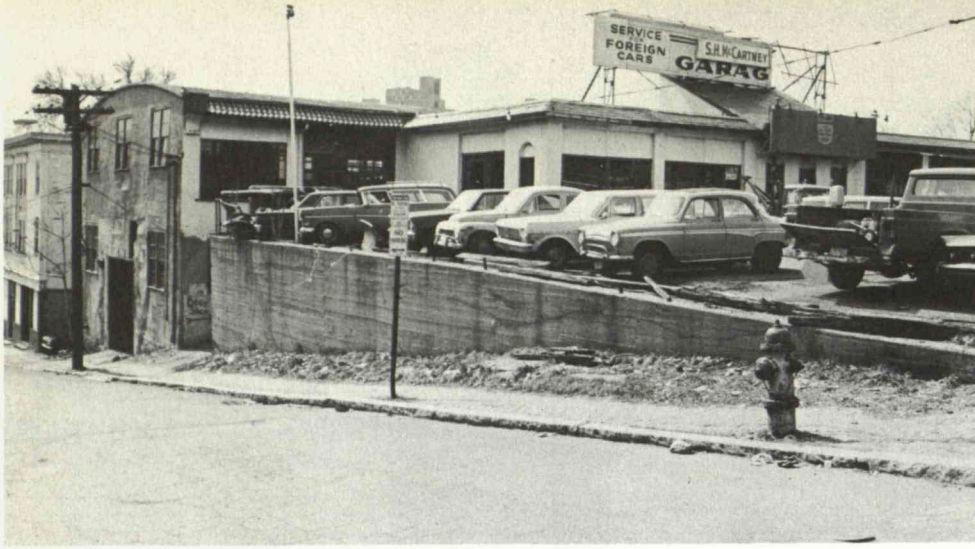
A prime location on Massachusetts Avenue for redevelopment.

Of these 1,600 new dwelling units, MIT hopes that up to 750 will be built under Federal and State programs to provide housing for low and moderate income families and the elderly--groups particularly hard hit by heavy recent rent increases here. The remainder of the new apartments will be rented at the lowest possible market rents. The sites to be developed include: