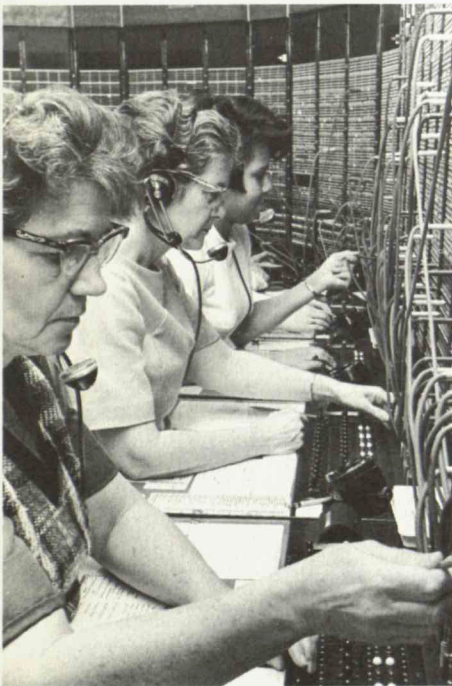
Snow-women of the switchboard.

If you're like most of us, you had very good intentions of filling out your income tax returns last January, but didn't. Maybe it's just