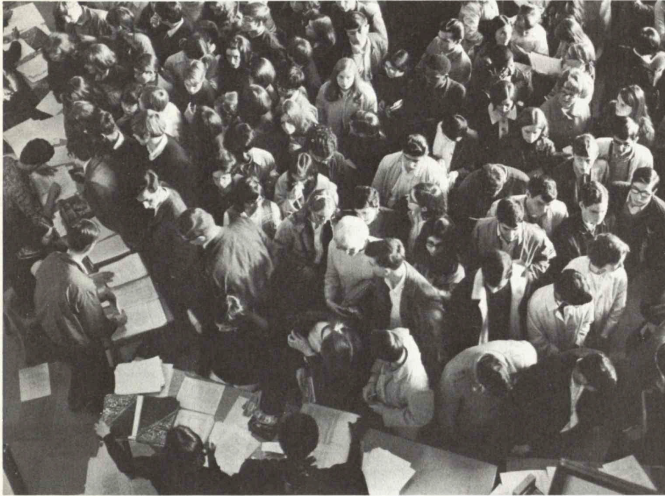
Population explosion at TCA's Saturday school.

An error in the newly published student directory needs correction. The sentence on page one reads, "For fire, first aid, or police, dial 10 on any telephone." This works for all Institute extensions, but does not apply to the dormitory telephone system. Students with dorm lines must dial 100 .