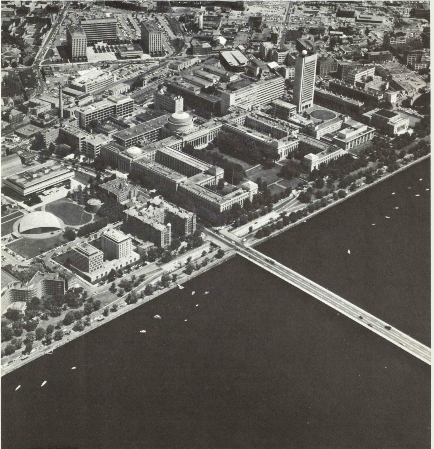
We change so rapidly, it's difficult to keep an up-to-date portrait--but here is a brand new one.

MASSACHUSETTS INSTITUTE OF TECHNOLOGY October 16, 1968