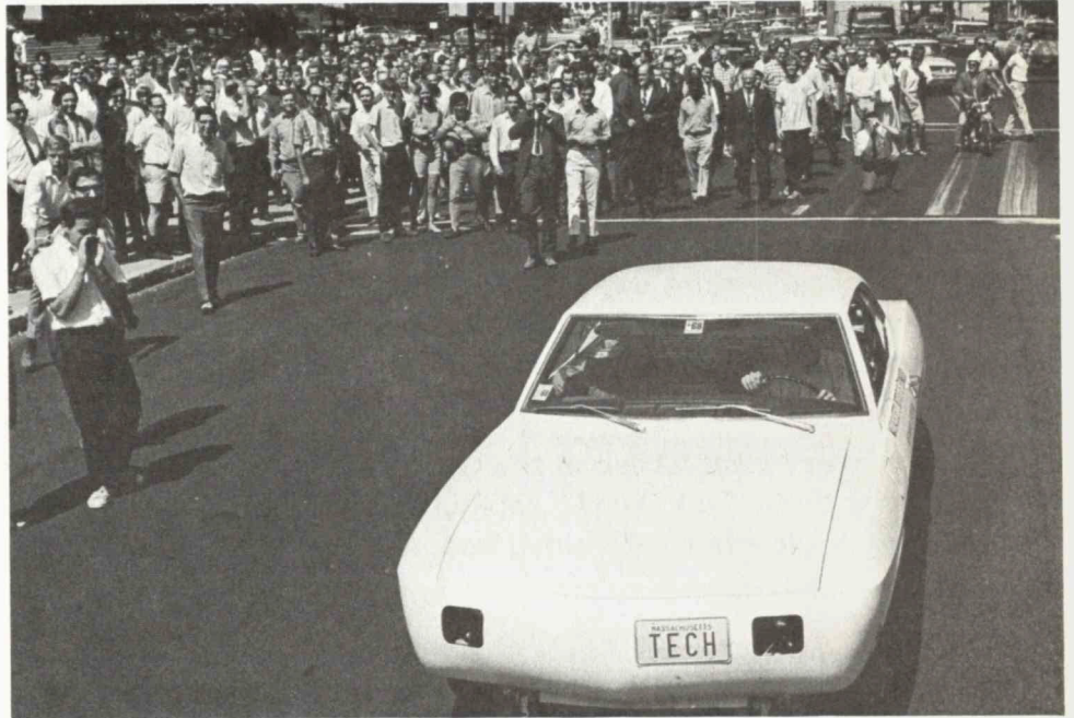
...just as the beginning of the race drew a resounding cheer from an enthusiastic throng.