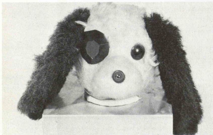
Here's one puppy the SPCA doesn't worry about.

Everyone is aware that the blood drought that began last winter has continued--sometimes critically--ever since. The Institute has offered the Cambridge Red Cross the use of du Pont Gymnasium on September 26 for a bloodmobile for the smaller industries in the area. Though no solicitation of MIT will be made, Institute donors will be welcome to participate in this drive.