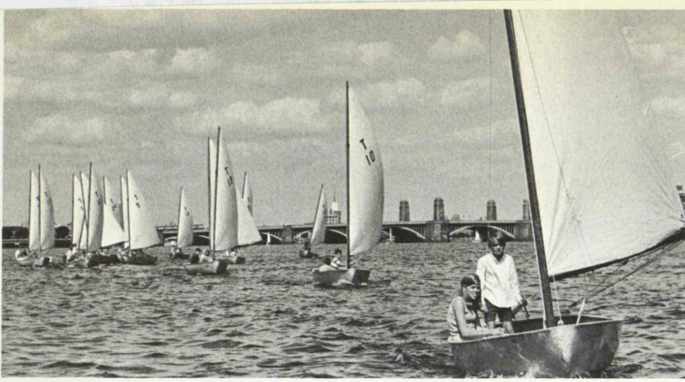
Regatta on the Charles.