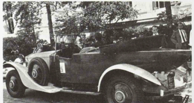
A nautical roadrunner.

Parked briefly in front of the fire hydrant near the main entrance was one of the best moving publicity stunts to visit the Institute in a long time. A mahogany boat body mounted on the venerable chassis of a Rolls Royce proclaimed an exhibit of English brass rubbings now displayed in a Boston gallery. The driver of the remarkable vehicle said the exhibit will travel on to New York, then to Texas, "if the car holds up."