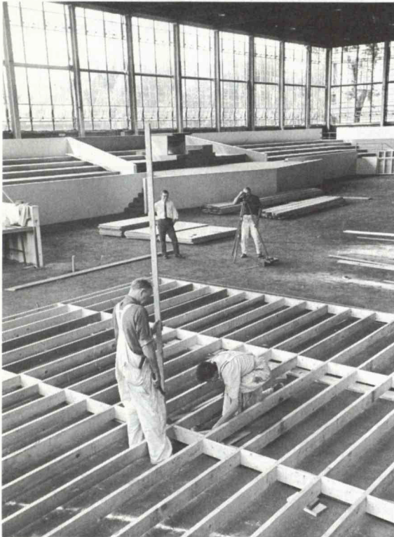
Workmen begin inaugural preparations in the Cage.