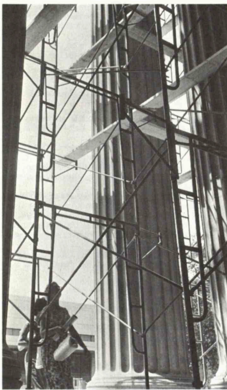
Face-lifting for the front door.

The sturdy limestone shell of the main complex was designed to withstand the elements for a long, long time, but enduring the oil and dust of its urban surroundings has given the Institute a dirty face. For seven or eight years, whenever the weather is fine, Physical Plant workmen have gone about cleaning up the limestone and re-caulking, or pointing up, the seams.