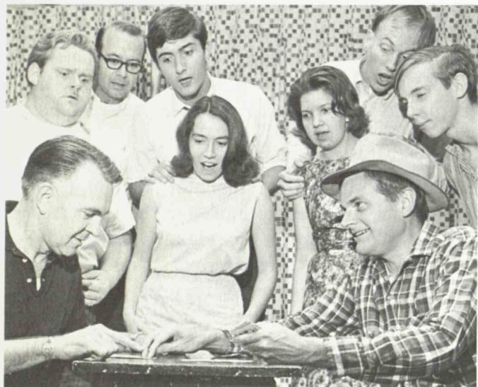
Tense moment in a poker game from the Community Players' summer production.