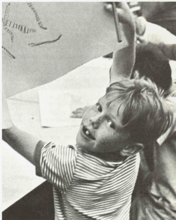
Snakes and snails, a young camper's delight.

Since it started in 1959, the MIT Day Camp has nearly tripled in size. This summer there are 140-some campers enrolled. In addition to art classes, camp days have two swimming periods for each group; campers can progress from beginners' bubbles to junior lifesaving levels. Other hours are filled with fencing, riflery, archery, tennis and many other activities including, for the first time this year, bowling in the Student Center games area.