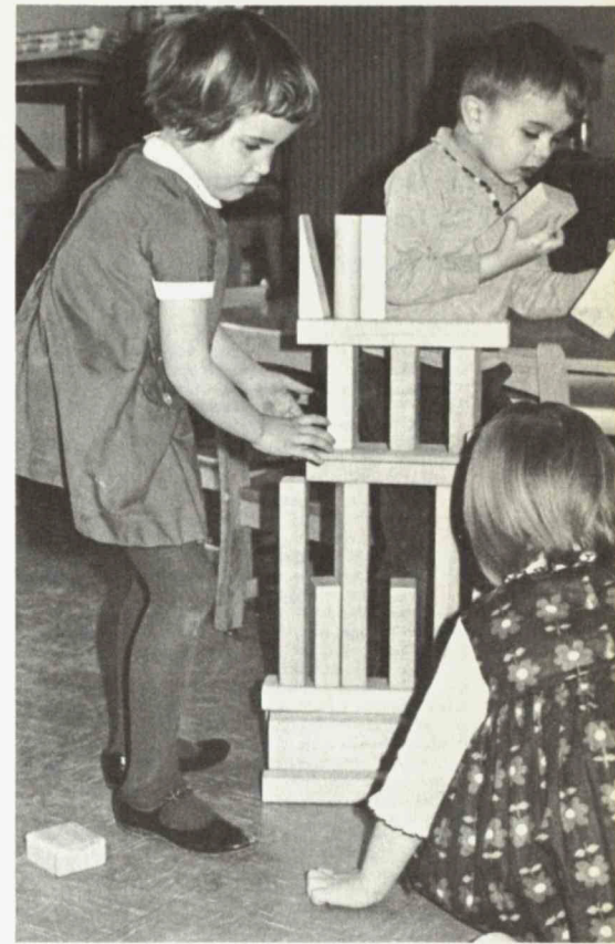
Theatrical beneficiaries: children at Technology Nursery School.