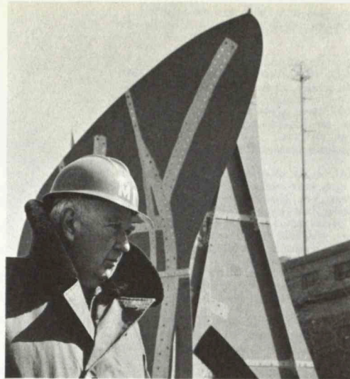
The sculptor and his work.