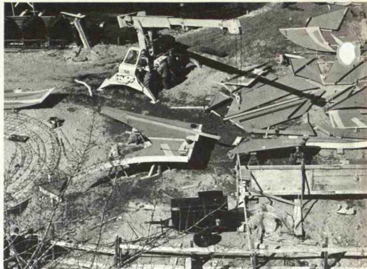
Giant jig-saw puzzle.