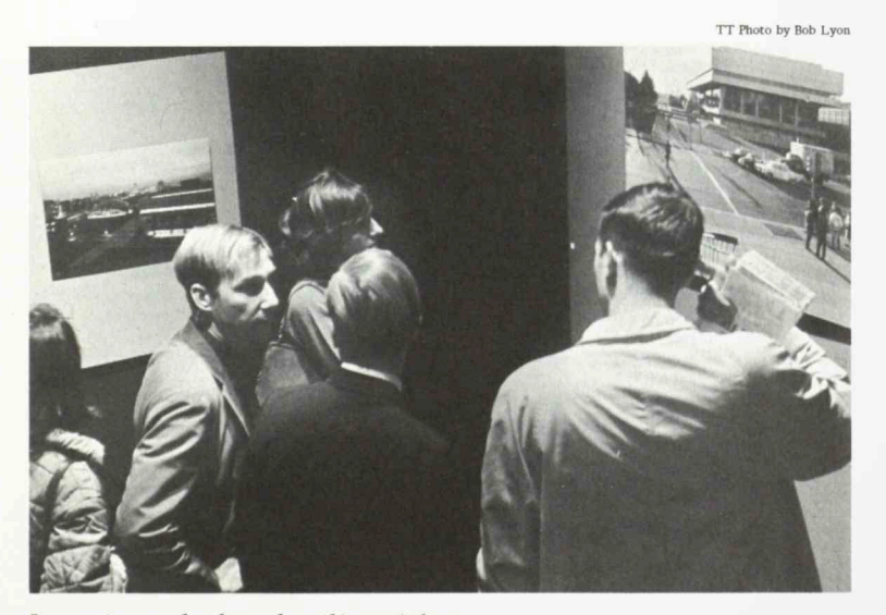
Learning to look at familiar sights.

No one would guess from its stern exterior that an art gallery thrives inside the Armory, but one does. Exhibits that change about once a month are an important part of a new curri-