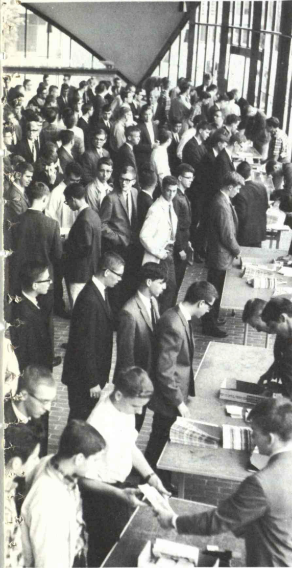
Freshmen registering for orientation program. Expected total student body this year: 7,300.