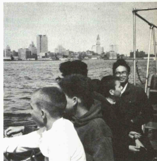
On the harbor