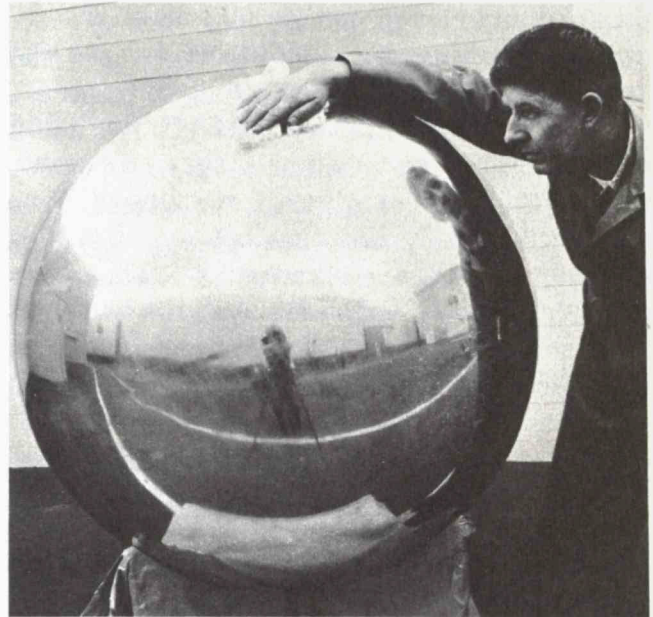
LCS on ground