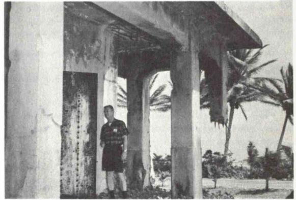
Huntington on Roi-Namur

The Technology Dames (wives of students) will hold their annual Fashion Show, Monday, March 15 at the MIT Faculty Club at 8 p.m. There will be an admission fee, and the show is open to the public.