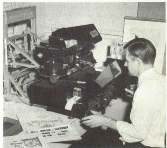
TT Photo by Bob Lyon

Illustration Service (Graphic Arts) has a new machine which can set 2,800 variations of any one type font. It's called a Photo-Typositor, and the styles are similar to most all available type faces. Basically, it uses film strips, like large typewriter ribbons. Each has capital and lower case alphabets for a style. The machine's operator can move the film to find the correct letter; then press a button and the letter is photographed and transferred by chemical solution to a clean strip of paper. It's almost like typing. The operator can change the shade or size of any letter. Especially useful for headings and posters, it's also, according to Illustration's Ed West, a good deal cheaper than typesetting. To see it, call Ext. 2375.