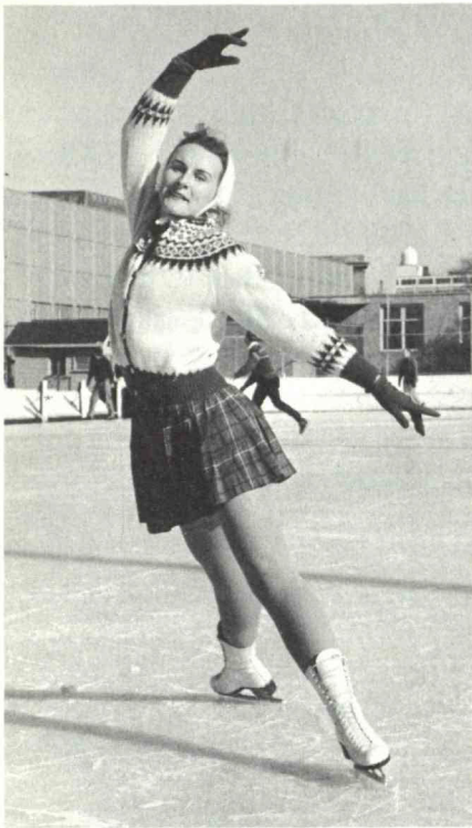
Grace on ice