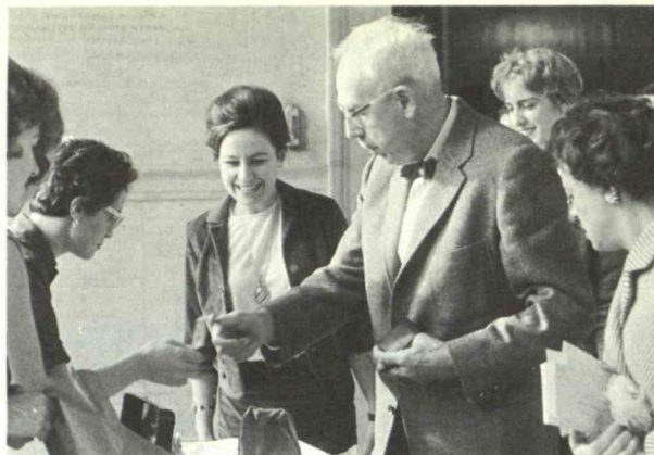
TT Photo by Bob Lyon