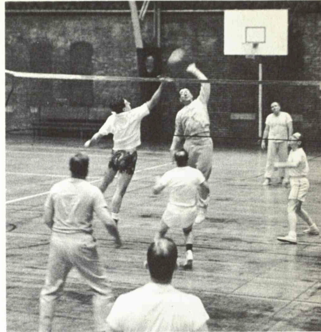
A real work-out