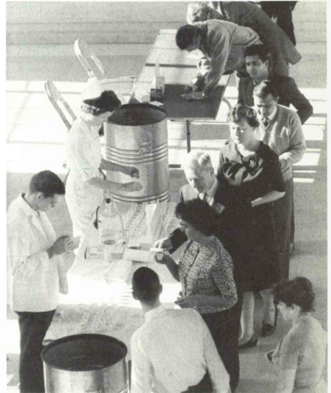
for the many.