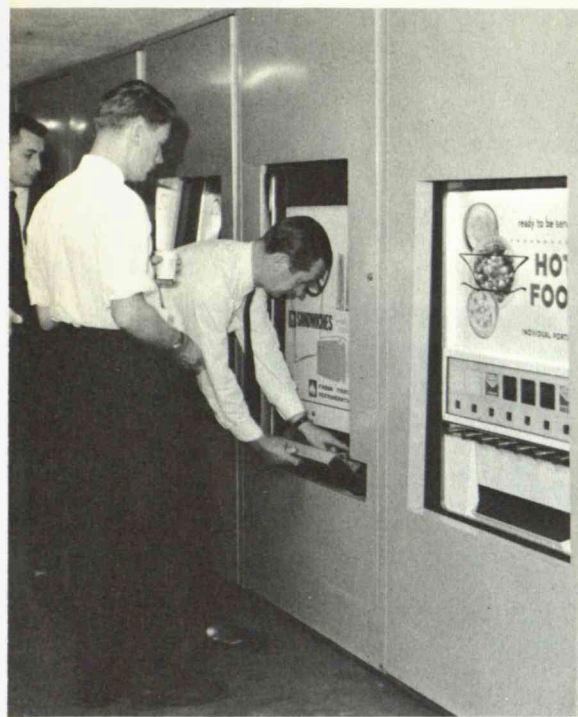
Lunch line in Bldg. 26