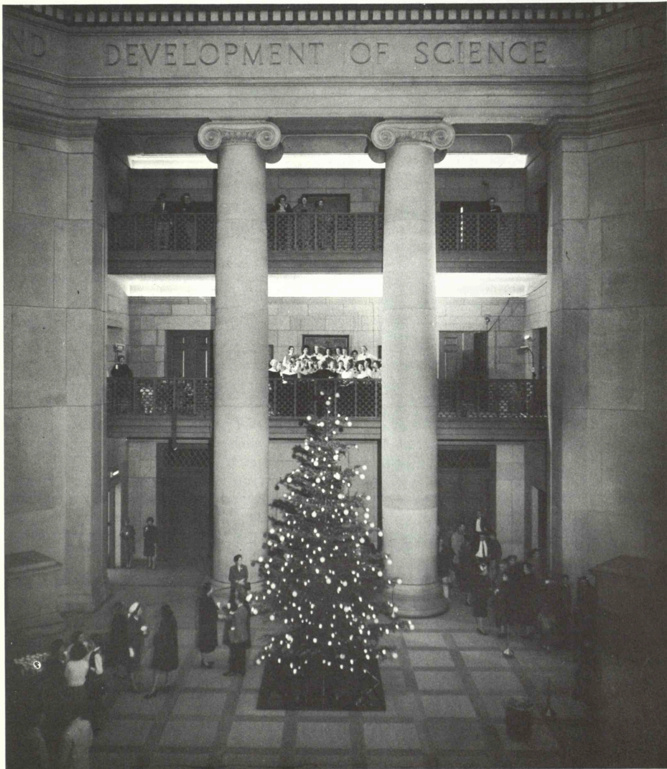
Technology Matrons' Christmas Party, Lobby, Bldg. 7.