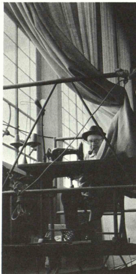
. . . where the drapes were hemmed high up in the rigging