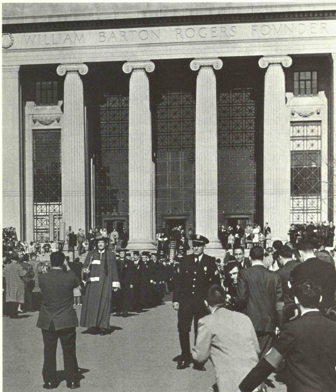
ACADEMIC PROCESSION FOR CENTENNIAL CONVOCATION