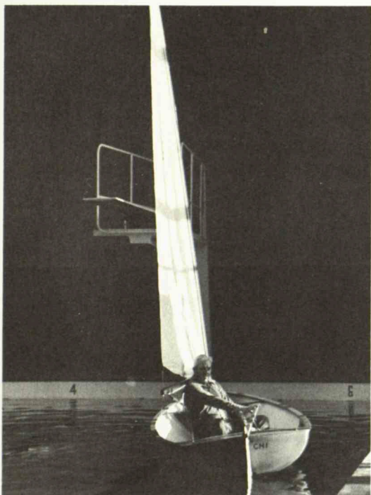
New indoor water sport

Payroll Office will take care of this, if you register your absences by December 15. "Reports of Absence" forms are available in department or project headquarters, and at the Personnel (Room 11-001), Bursar's (Room 4-106) and Payroll (Room 24-211) Offices.