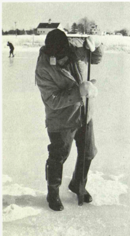
Angler Peterson set to strike

This machine is one of the few in the country producing liquid nitrogen at such low pressure. It can make as many as 45 cans a day and last year supplied the Institute and Lincoln Lab with 190,000 liters, or 175 tons. Helium production was in the 10,000-liter range; which, if placed in milk bottles, would make a row from here to Central Square.