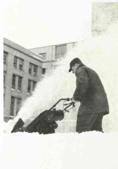
"Snow in drifts . . . as the season shifts" (Old Farmers Almanac, March 1960)