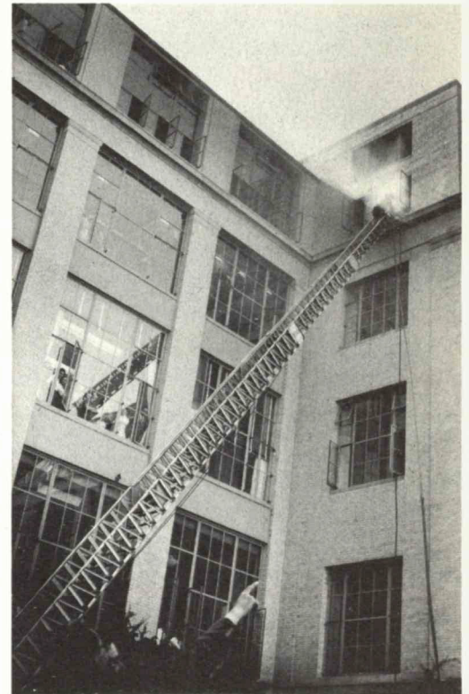
Up, up, and away