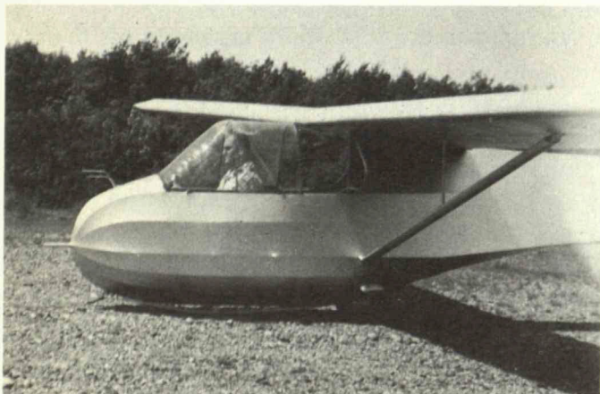
Altitudes of 40,000 feet . . .