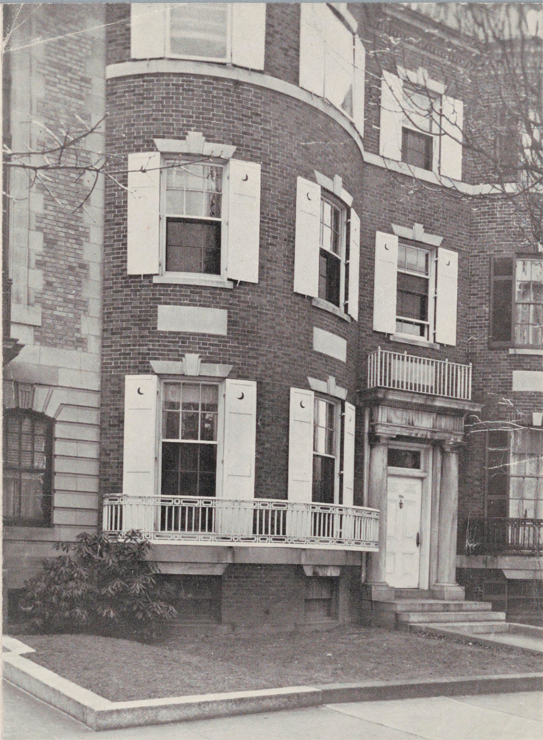
THE M. I. T. WOMEN'S DORMITORY 120 BAY STATE ROAD, BOSTON