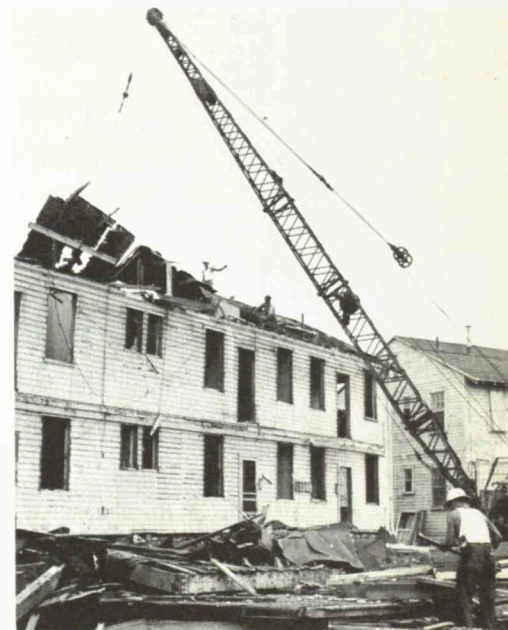
Duane raises the roof